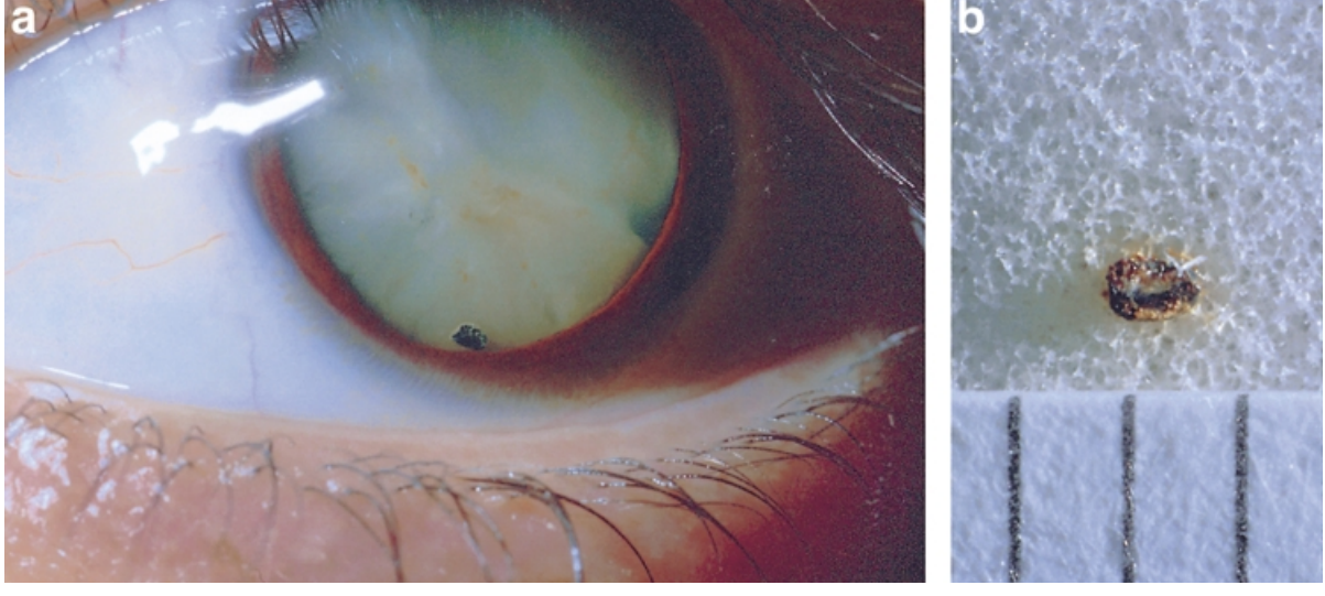
Figure 2. (a) Preoperative photograph showing metallic foreign body at inferior dilated pupil margin. The foreign body location at original presentation is evident as a rust mark just below the centre of the pupil. (b) Photograph of intraocular foreign body after its removal from the eye. Note evidence of corrosion indicating ferrous composition. Scale is millimetres, therefore size is approximately 1 mm.

Figure 1. (a,b) Preoperative X-ray. Reported as no evidence of intraocular foreign body; however, closer inspection does show evidence of a metallic intraocular foreign body (\rightarrow) . (c) The radiological appearance is better appreciated when the intraocular foreign body is viewed as imaged by X-ray after its removal from the eye.