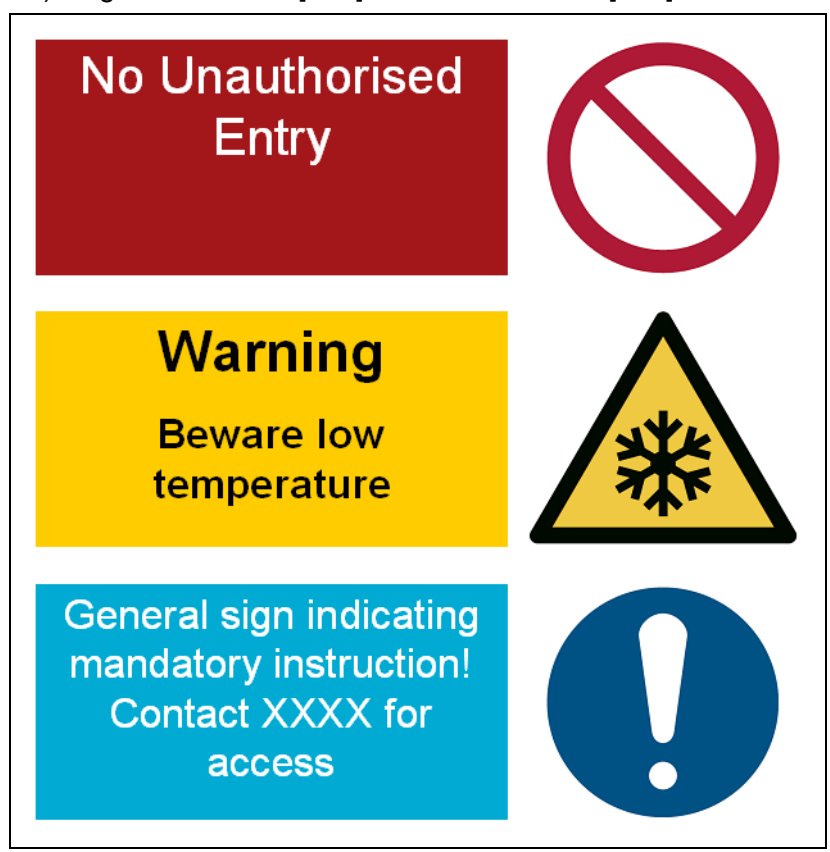
Figure 3 Cryogen Hazard sign

Adequate, clearly visible warnings must be displayed where necessary (an example is shown in Figure 3). For examples of recognised warning and prohibitive signs users should refer to the Health & Safety (Safety Signs & Signals) Regulations 1996 [114] and BS ISO 7010 [115].